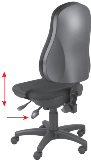
Reclining of the seat