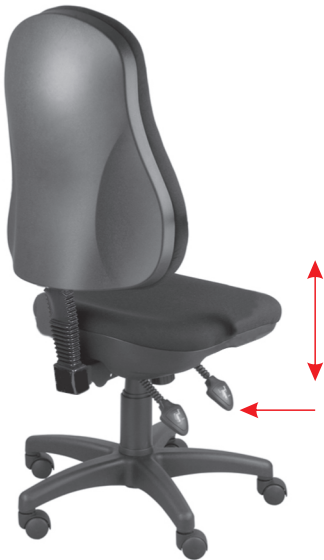
Height adjustment of the seat

e-mail: CustomerService@technikoffice.co.uk