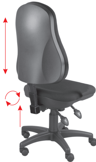
Height adjustment of the back