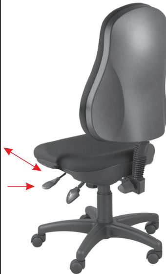
Reclining of the seat