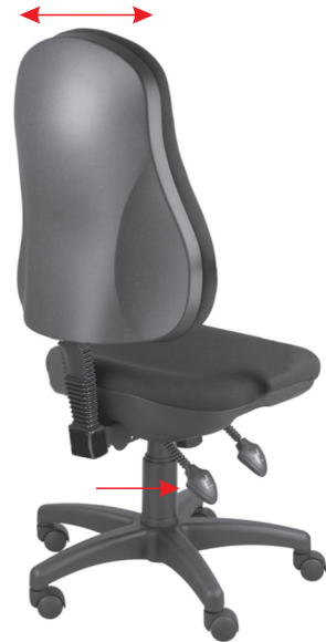
Reclining of the back